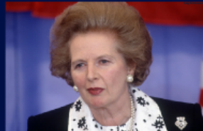
UK - Margaret Thatcher, 1979-1990