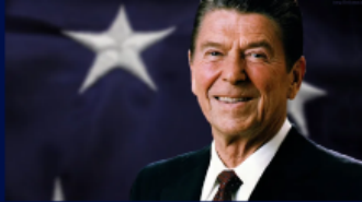
US - Ronald Reagan, 1981-1988