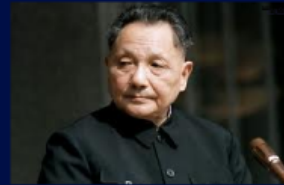
China - Deng Xiaoping, 1978-1992