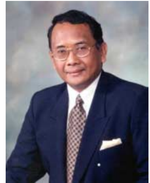
First Chairman Makarim Wibisono