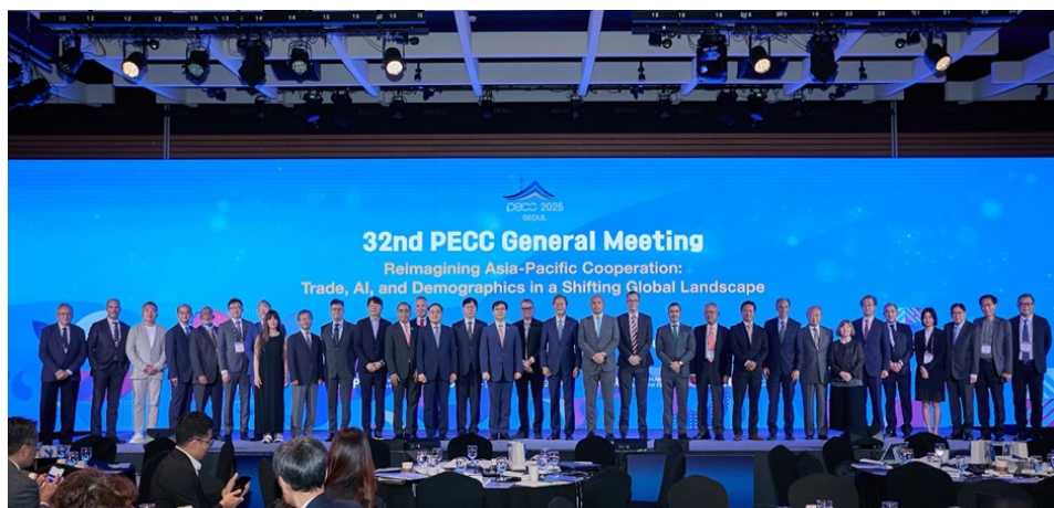
Group Photo: Role-players for the 32nd PECC General Meeting.

The 32nd PECC General Meeting, co-hosted by the Korea Institute for International Economic Policy (KIEP) and the Federation of Korean Industries (FKI), was held in Seoul, Korea on August 12, 2025. The meeting, themed “Reimagining Asia-Pacific Cooperation: Trade, AI, and Demographics in a Shifting Global Landscape”, provided valuable insights and fostered discussions on a range of economic, social, and policy challenges.