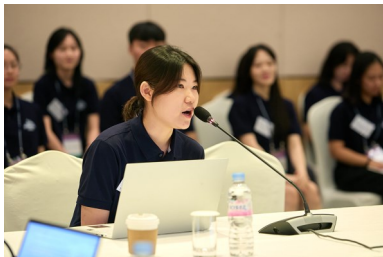
Presentation from the AGenda team