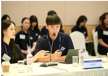
Presentation from the VOYCE team