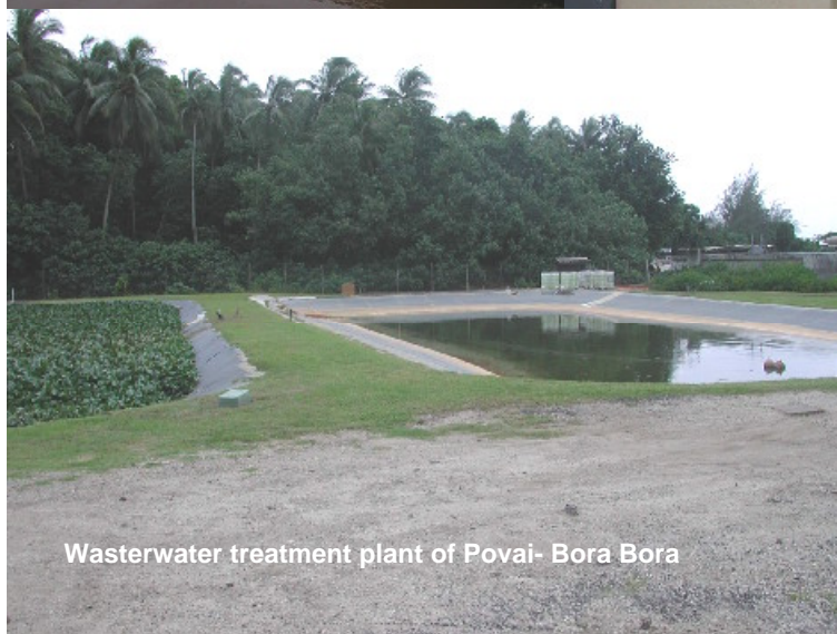
Wasterwater treatment plant of Povai- Bora Bora